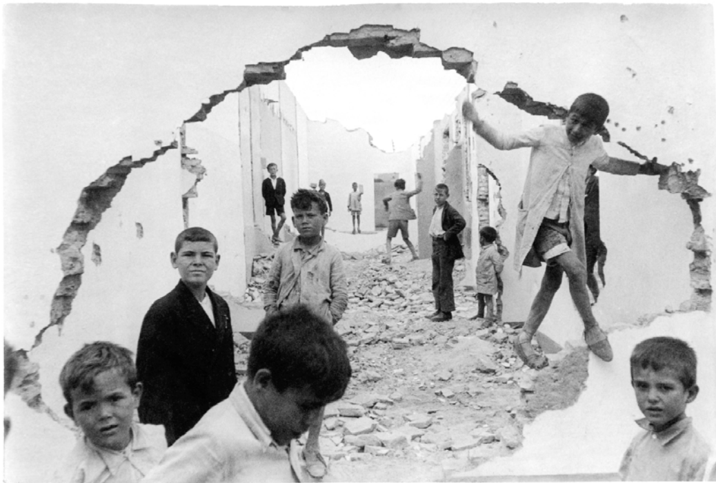
Henri Cartier-Bresson Sevilla, Spain, 1933 [2 of 2]

High School Pre-Visit Project: Prosecuting Power