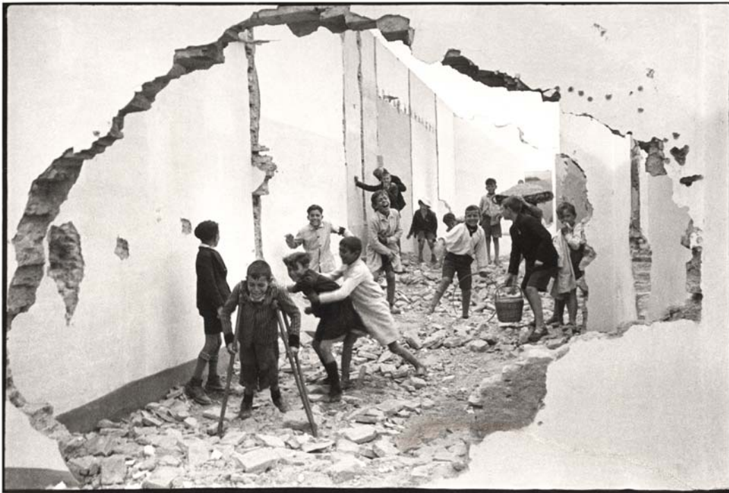
Henri Cartier-Bresson, Sevilla, Spain, 1933 [1 of 2]

High School Pre/Post-Visit Project: Prosecuting Power